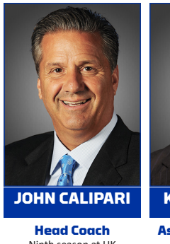
JOHN CALIPARI Head Coach Ninth season at UK @UKCoachCalipari @UKCoachCalipari