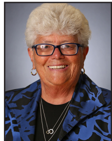
LIN DUNN ASSISTANT COACH

(7th overall at UK) Americus, Ga. (Tennessee, '00/TTU, '02)