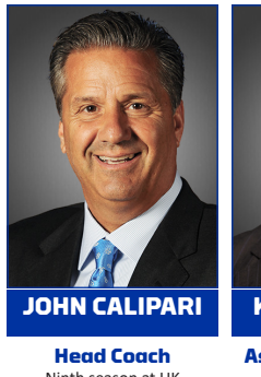
JOHN CALIPARI Head Coach Ninth season at UK @UKCoachCalipari @UKCoachCalipari