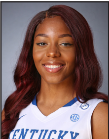
DORIE HARRISON CENTER

5-8 – R-Sr. Monticello, Ky. (Wayne County HS/ Bellarmine)