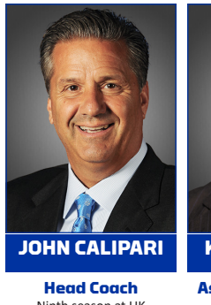
JOHN CALIPARI Head Coach Ninth season at UK @UKCoachCalipari @UKCoachCalipari