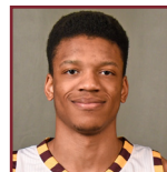
3 ANUMBA Fr. ▶ Guard

MIN. 31.0 PPG 9.8 RPG 2.8 APG 3.5 FG% 42.9 3FG% 39.1