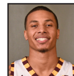
25 FERGUSON Jr. ▶ Forward

MIN. 24.0 PPG 14.8 RPG 4.5 APG 2.5 FG% 61.5 3FG% 50.0