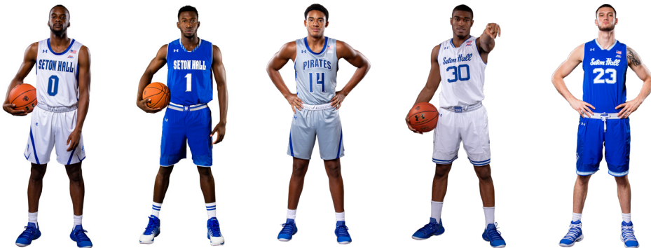
HOME WHITE | ROAD BLUE | ALTERNATE GREY | THROWBACK WHITE | THROWBACK BLUE