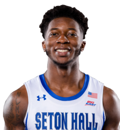
#22 - CALE

DOUBLE-DOUBLES SEASON --> -- CAREER --> 1 STREAK --> -- DOUBLE-FIGURE SCORING SEASON --> 1 CAREER --> 19 STREAK --> -- 20+ POINT GAMES SEASON --> -- CAREER --> 1 STREAK --> -- 10+ REBOUND GAMES SEASON --> -- CAREER --> 1 STREAK --> --