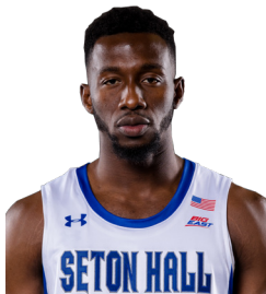
#1 - NZEI

DOUBLE-DOUBLES SEASON --> -- CAREER --> 3 STREAK --> -- DOUBLE-FIGURE SCORING SEASON --> 4 CAREER --> 51 STREAK --> 1 20+ POINT GAMES SEASON --> -- CAREER --> 14 STREAK --> -- 5+ ASSIST GAMES SEASON --> 1 CAREER --> 11 STREAK --> --