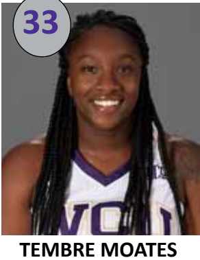
Jr. | Guard/Forward