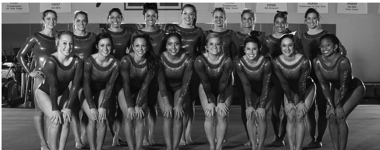
The 2014 Kentucky gymnastics team scored the highest at an NCAA Regional meet with a 195.925 score.