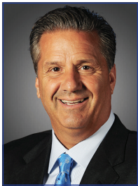
JOHN CALIPARI Head Coach 10th Season @UKCoachCalipari @UKCoachCalipari @UKCoachCalipari