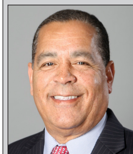
KELVIN SAMPSON Head Coach 5th Season at Houston 30th Season Overall