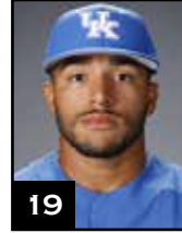
19 ALEX RODRIGUEZ