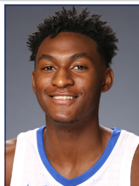
5 IMMANUEL QUICKLEY