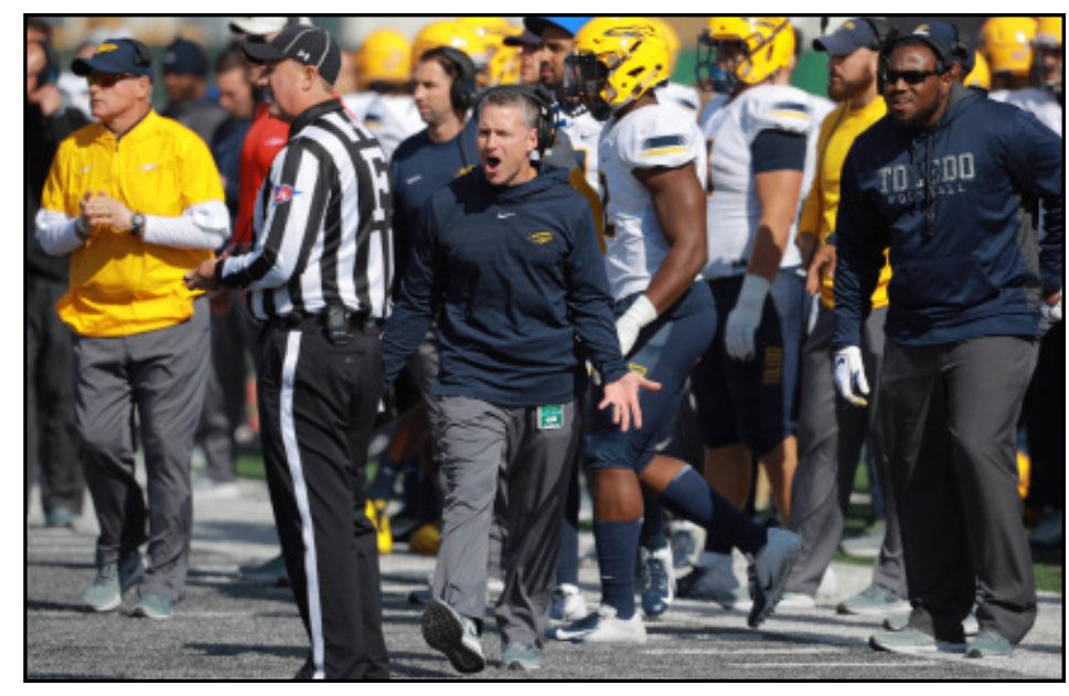
Candle has coached 25 players who have played in the NFL or are currently on NFL rosters. Six Rockets were selected in the last three NFL drafts.

The 2016 Rockets featured one of the top offenses in the country, ranking in the top 10 in five offensive categories, including passing efficiency (second), third-down conversions (fifth), total offense (seventh) and passing offense (10th). Toledo set the school record with an aver-