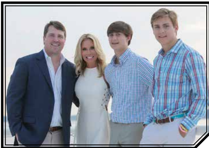
SOUTH CAROLINA VS KENTUCKY