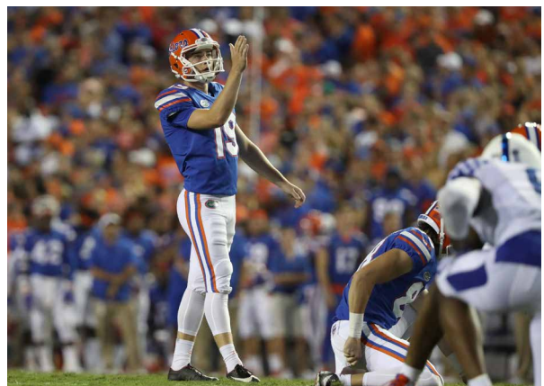
Florida missed numerous opportunities against Kentucky, but a controversial missed field goal--which snapped a streak of 20 consecutive makes for UF kickers--was a deflating moment for the Gators.