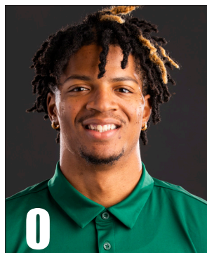
White's Complete bio