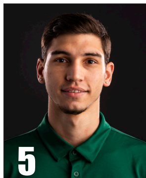
Havsa's Complete bio