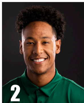
Overton's Complete bio