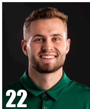
Jardine's Complete bio