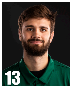
Morley's Complete bio