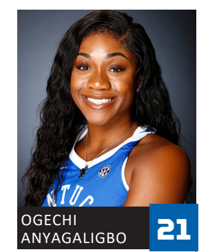
6-1 - R-Sr. - F Miami, Fla. (Miami County Day HS/Stony Brook)