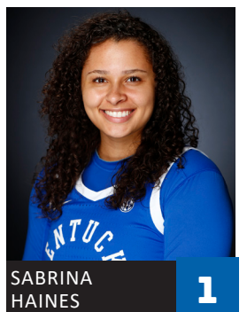
5-10 - R-Sr. - TR - G Phoenix, Ariz. (Arizona St./Desert Vista HS)