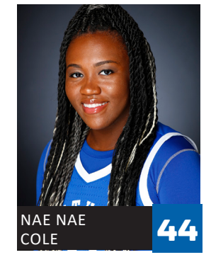
6-3 – R-Sr. – TR – C Gainesville, Va. (NC State/Paul VI HS)