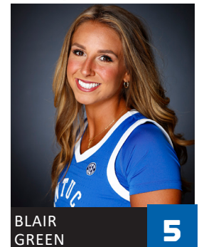
6-0 - So. - GHarlan County, Ky. (Harlan County HS)