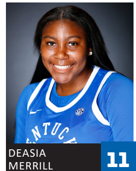
6-1 – Fr. – F Villa Rica, Ga. (Villa Rica HS)