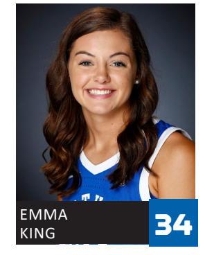
5-10 – Fr. – G Stanford, Ky. (Lincoln County HS)