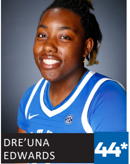
* sitting out 2019-20 season due to NCAA transfer rules