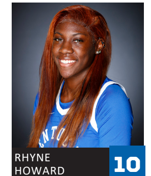
6-2 – So. – G Cleveland, Tenn. (Bradley Central HS)