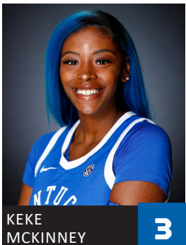
6-1 – Jr. – F Knoxville, Tenn. (Fulton HS)