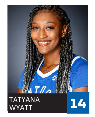
6-2 – Jr. – F Columbus, Ga. (Columbus HS)