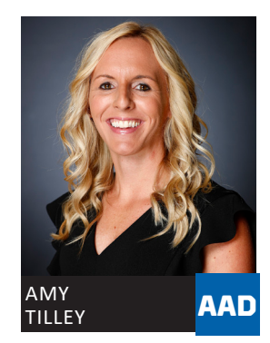
Asst. AD/Director of Ops. (10th overall at UK) Somerset, Ky.