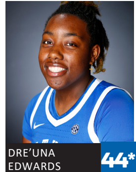
6-2 – So. – F Las Vegas, Nev. (Liberty HS/Utah)