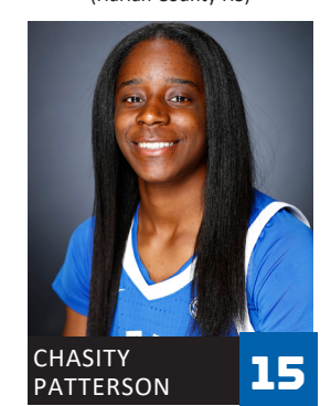
5-5 – Jr. – T – G Houston, Texas (North Shore HS/Texas)