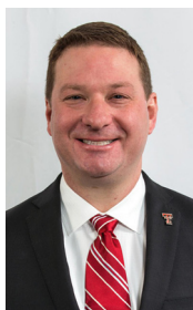
CHRIS BEARD Head Coach