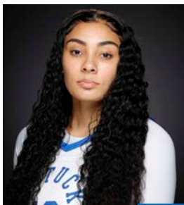
TREASURE HUNT 12

6-2 – Jr. – G Cleveland, Tenn. (Bradley Central HS)