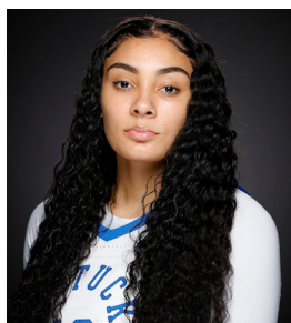
TREASURE HUNT 12

6-2 – Jr. – G Cleveland, Tenn. (Bradley Central HS)