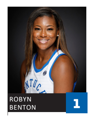
5-9 – Jr. – TR – G Conyers, Ga. (Greater Atlanta Christian/Auburn)