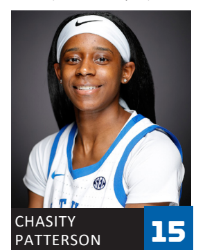
5-5 – Sr. – G Houston, Texas (North Shore HS/Texas)