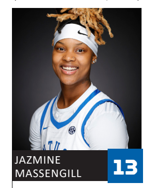
6-0 – Jr. – G Chattanooga, Tenn. (Hamilton Heights Christian/Tenn.)