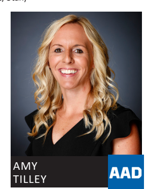
Asst. AD/Director of Ops. (11th overall at UK) Somerset, Ky.