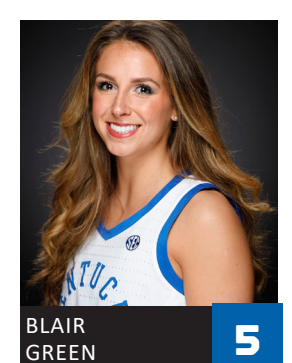
6-0 – Jr. – G Harlan County, Ky. (Harlan County HS)