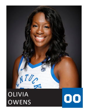
6-4 – R-Soph. – TR – C Albany, N.Y. (Niskayuna HS/Maryland)