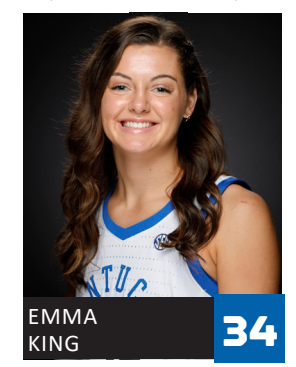
5-10 – Soph. – G Stanford, Ky. (Lincoln County HS)