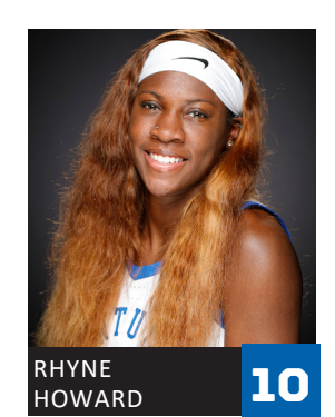
6-2 – Jr. – G Cleveland, Tenn. (Bradley Central HS)