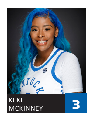
6-1 - Sr. - F Knoxville, Tenn. (Fulton HS)