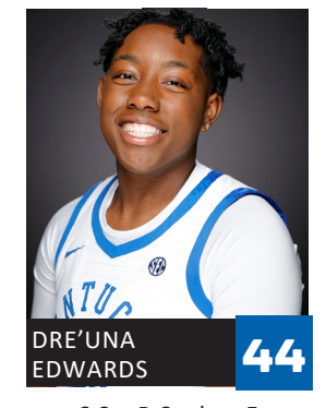
6-2 – R-Soph. – F Las Vegas, Nev. (Liberty HS/Utah)