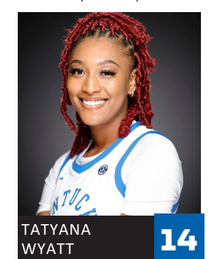
6-2 – Sr. – F Columbus, Ga. (Columbus HS)