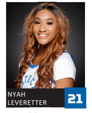
6-3 – Fr. – F Blythewood, S.C. (Westwood HS)