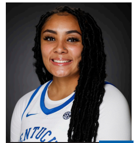
TREASURE HUNT 12

5-7 – Fr. – G Richmond, Va. (Bradley Central HS)