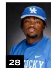
28 ORAJ ANU