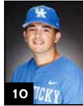
10 HUNTER JUMP