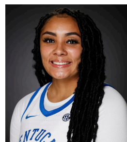
TREASURE HUNT 12

5-7 – Fr. – G Richmond, Va. (Bradley Central HS)