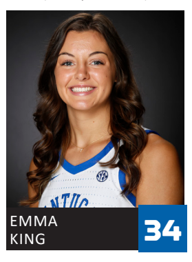
5-10 – Jr. – G Stanford, Ky. (Lincoln County HS)