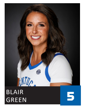
6-0 – Sr. – G Harlan County, Ky. (Harlan County HS)