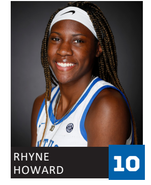
6-2 – Sr. – G Cleveland, Tenn. (Bradley Central HS)