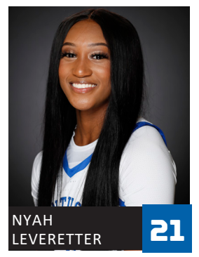
6-3 – So. – F Blythewood, S.C. (Westwood HS)