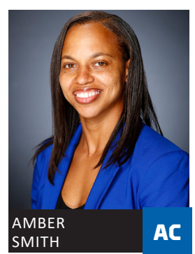
Assistant Coach (11th overall season at Kentucky)