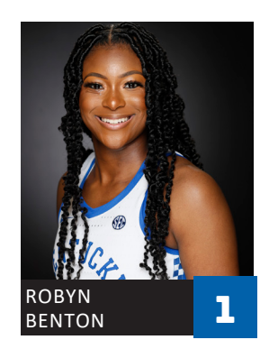
5-9 — Sr. — G Conyers, Ga. (Greater Atlanta Christian/Auburn)