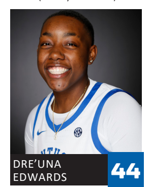
6-2 – R-Jr. – F Compton, Calif. (Liberty HS/Utah)