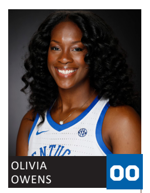
6-4 — R-Jr. — C Albany, N.Y. (Niskayuna HS/Maryland)