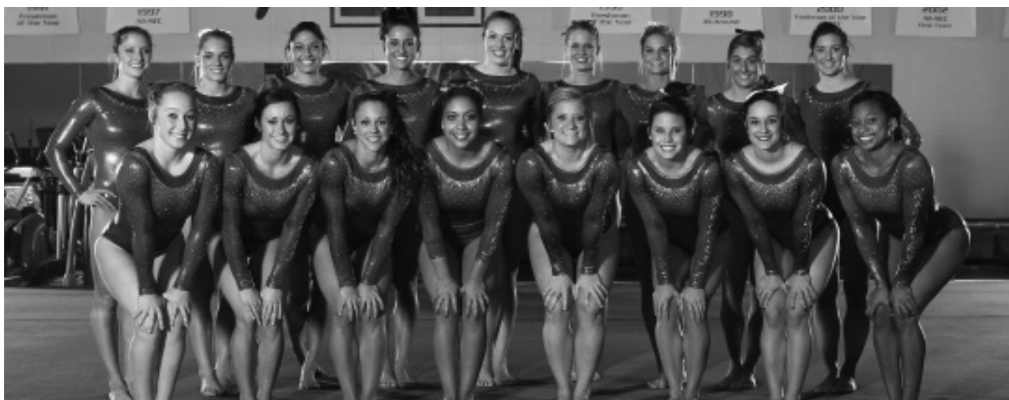
The 2014 Kentucky gymnastics team scored the highest at an NCAA Regional meet with a 195.925 score.