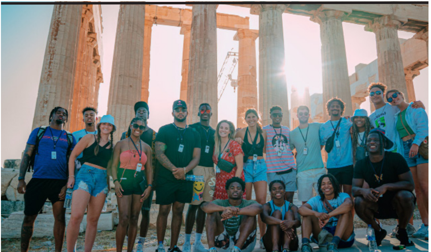
SIXTEEN GATORS SCHOLAR-ATHLETES traveled to Greece this summer for a 10-day service trip.

"This is an area where people can invest in the player. And at the University of Florida, with the alumni network that we have and the top-five university education that we offer, there's no reason we can't do just that." - Head Coach Billy Napier