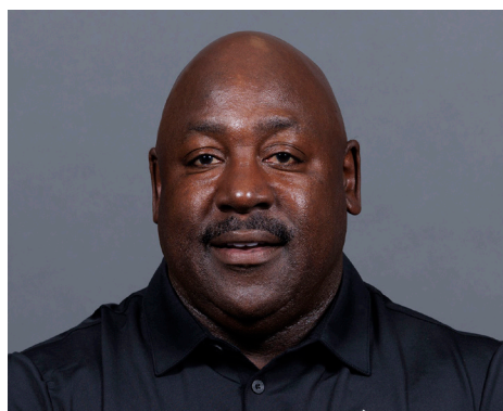
Wesley McGriff Secondary | Field