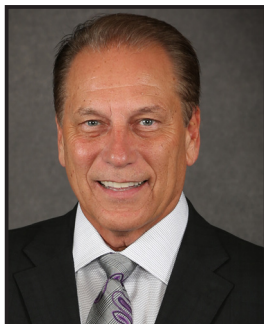
TOM IZZO HEAD COACH 28TH SEASON