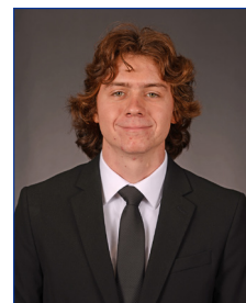
GA Justice England