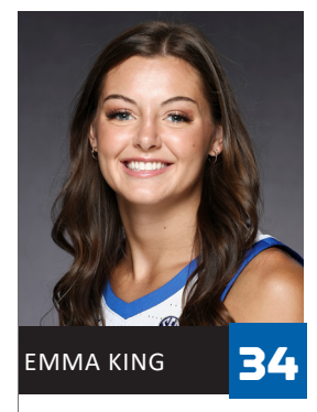
G - 5-10 - Sr. Stanford, Ky. (Lincoln County HS)