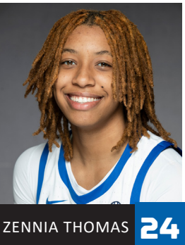
F - 6-2 - Fr. Lyndhurst, Ohio (Warrensville Heights HS)

F - 6-3 - Jr. Baltimore, Md. (Baltimore Polytechnic Inst./LSU)