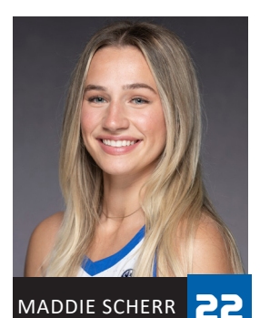
G - 5-11 - Jr. Florence, Ky. (Ryle HS/Oregon)