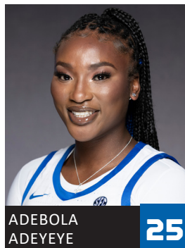
F - 6-2 - Gr. Brampton, Ontario (The Rock School/Buffalo)

G - 5-10 - Fr. Lawrenceburg, Ky. (Anderson County HS)