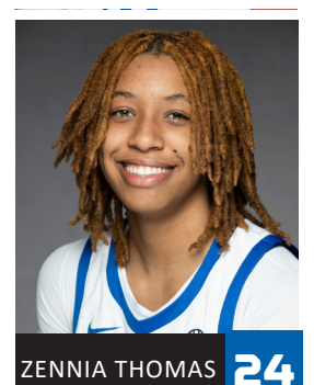
F - 6-2 - Fr. Lyndhurst, Ohio (Warrensville Heights HS)