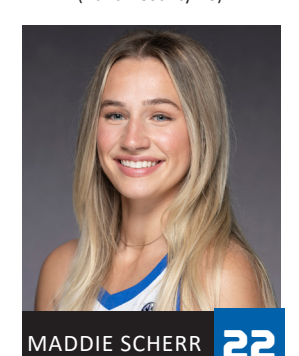
G - 5-11 - Jr. Florence, Ky. (Ryle HS/Oregon)