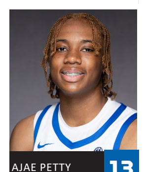
F - 6-3 - Jr. Baltimore, Md.