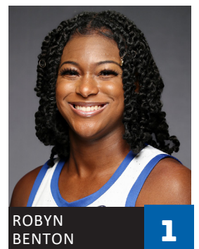
G - 5-9 - Gr. Conyers, Ga. (Greater Atlanta Christian/Auburn)