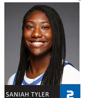
G - 5-6 - Fr. Florissant, Mo. (Incarnate Word Academy)