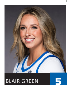
G - 6-2 - Gr. Harlan County, Ky. (Harlan County HS)