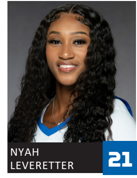
F - 6-3 - Jr. Blythewood, S.C. (Westwood HS)