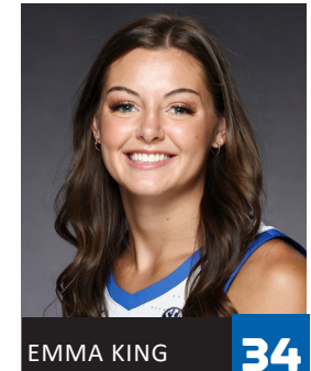
G - 5-10 - Sr. Stanford, Ky. (Lincoln County HS)