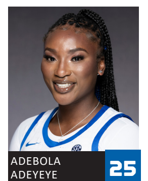
F - 6-2 - Gr. Brampton, Ontario (The Rock School/Buffalo)