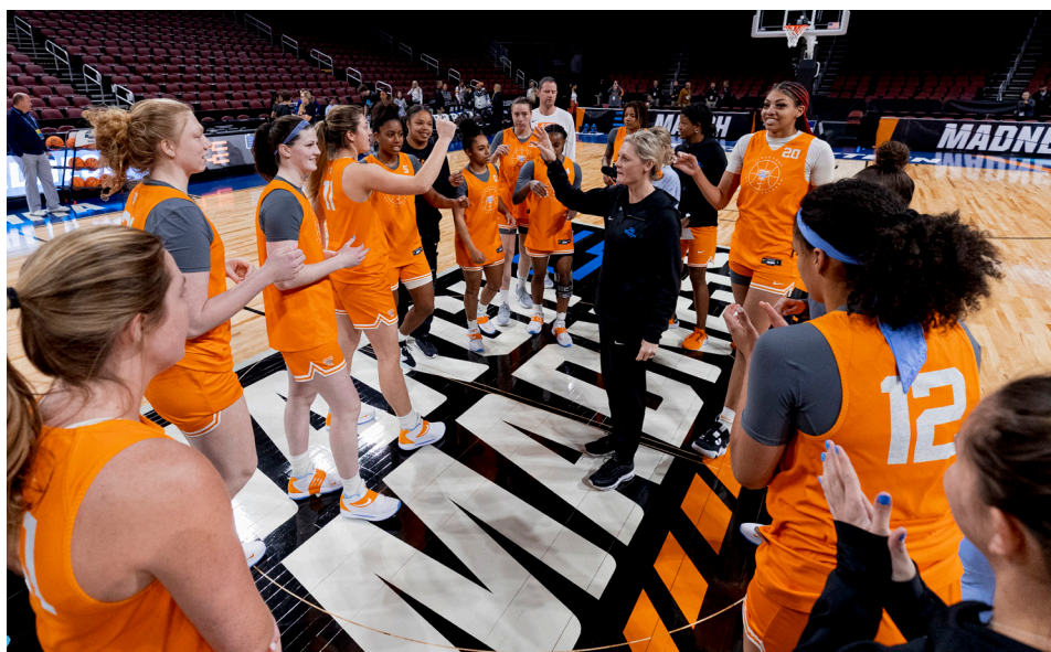
Kellie Harper has led Tennessee to back-to-back NCAA appearances, including a Sweet 16 berth in 2022.