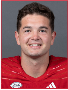
QB • 6-2 • 225 • Sr. Independence CC Colorado Springs, Colo.