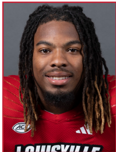
LB • 6-1 • 230 • R-So. Lowndes Valdosta, Ga.