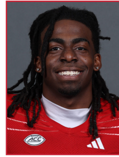
DB • 5-10 • 185 • R-Jr. Iowa Western CC Warner Robins, Ga.