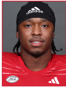
RB • 5-10 • 185 • R-Jr. Syracuse Long Island, N.Y.