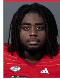
DL • 6-2 • 305 • R-So. Collierville Collierville, Tenn.