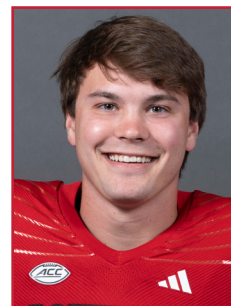
P • 6-1 • 200 • Jr. Farragut Knoxville, Tenn.