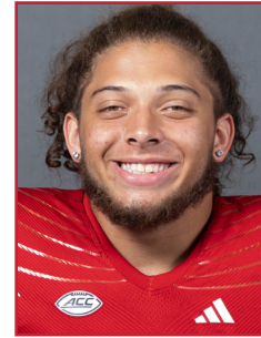
DL • 6-3 • 270 • Jr. Boca Raton Boca Raton, Fla.