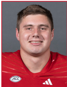
TE • 6-3 • 235 • Gr. Kentucky Country Day Louisville, Ky.