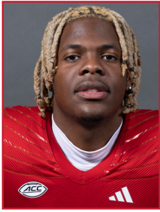
DB • 6-0 • 185 • R-Jr. Middle Tennessee Columbia, S.C.