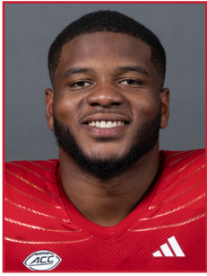
LB • 6-1 • 230 • Jr. Valdosta Valdosta, Ga.