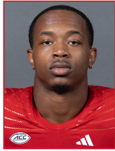
DB • 6-1 • 200 • R-Sr. North Carolina Boiling Springs, N.C.