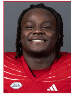
DL • 6-0 • 290 • R-Jr. Georgia State Powder Springs, Ga.