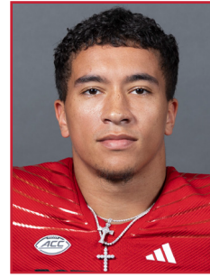
DB • 6-2 • 210 • R-Sr. North Carolina Chesapeake, Va.