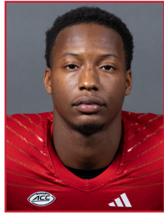
WR • 6-1 • 185 • R-Jr. Georgia State LaGrange, Ga.