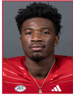
LB • 6-2 • 225 • So. Carver Columbus, Ga.