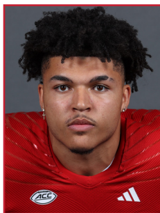
RB • 6-1 • 225 • Sr. Wisconsin Clayton, Ind.