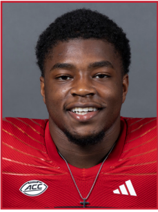
RB • 5-10 • 190 • So. Coffee Nicholls, Ga.