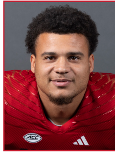
TE • 6-4 • 245 • R-Sr. UCF Jacksonville, Fla.