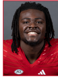
DL • 6-3 • 250 • So. Westfield Westfield, Ind.