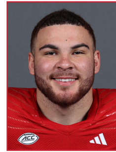
LB • 6-2 • 235 • Jr. Oregon Lebanon, Ore.