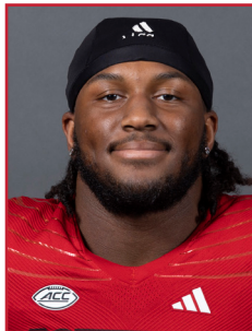
DL • 6-3 • 270 • R-Jr. Eastern Louisville, Ky.