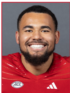
DL • 6-4 • 240 • R-Sr. Stanford Louisville, Ky.