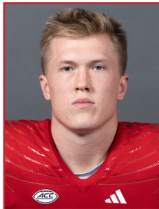
TE • 6-3 • 235 • So. Gonzaga Washington, D.C.