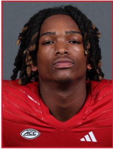
WR • 6-2 • 190 • Jr. Cincinnati Chicago, Ill.