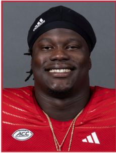
DB/LB • 6-1 • 220 • R-Sr. Miami Coconut Grove, Fla.