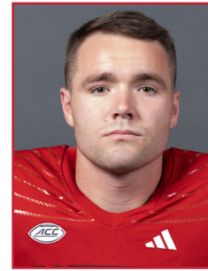
K • 6-1 • 205 • Jr. North Paulding Acworth, Ga.