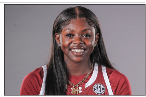
Awards High School WBCA Honorable Mention All-America (2023)