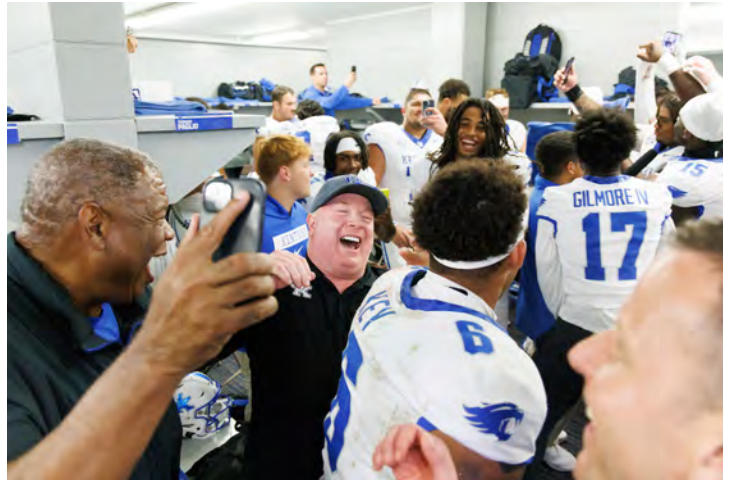
Kentucky celebrated after defeating No. 6/5 Ole Miss earlier this season on the road, its highest-ever AP-ranked win on an SEC opponent's campus