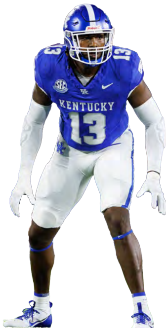
Kentucky edge rusher J.J. Weaver is one of the most prolific quarterback harassers among active FBS players.