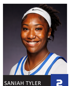
G - 5-6 - Jr. Florissant, Mo. (Incarnate Word Academy)