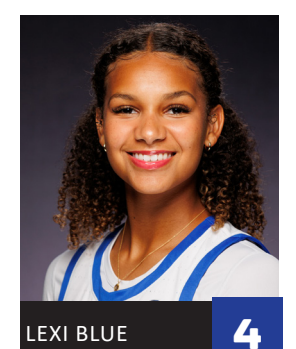
G - 6-2 - Fr. Orlando, Fla. (Lake Highland Prep)