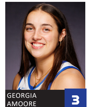
G - 5-6 - Gr. Ballarat, Victoria, Australia (Loretto College Ballarat / Virginia Tech)