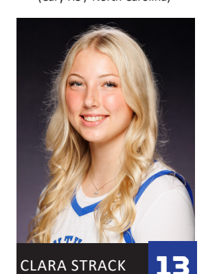
C - 6-5 - So. Buffalo, N.Y. (Hamburg HS / Virginia Tech)