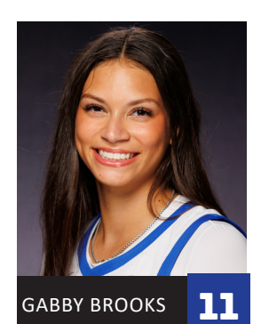
G - 5-10 - So. Harrisonburg, Va. (Blacksburg HS / Virginia Tech)