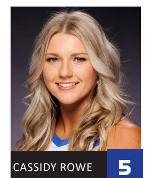
G - 5-5 - Jr. Virgie, Ky. (Shelby Valley HS)