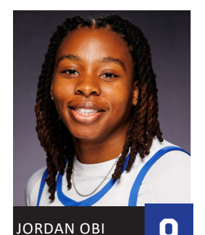
G - 6-1 - Gr. Hartford, Conn. (Choate Rosemary Hall / Penn)