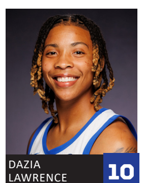
G - 5-8 - R-Sr. Greenville, N.C. (Mallard Creek HS / Charlotte)