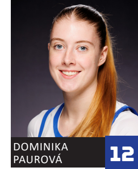
G - 6-1 - So. Mladá Boleslav, Czech Republic (DME Academy / Oregon State)