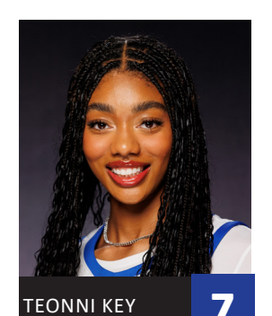
F - 6-4 - Jr. Cary, N.C. (Cary HS / North Carolina)