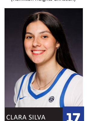
C - 6-7 - Fr. Faro, Portugal (Escola Secundária de Fonseca Benevides)