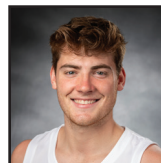
R.SR. // GUARD #3

Mins/Game: 34.4 Points/Game: 14.5 Shooting %: 53.5 Shot Attempts: 166-310 3pt Shooting %: 40.0 3pt Shooting: 32-80 Free Throw %: 79.8 FT Attempts: 87-109 Reb./Game: 8.0