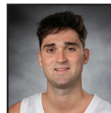
GR. // GUARD #22

Mins/Game: 33.1 Points/Game: 12.3 Shooting %: 52.5 Shot Attempts: 149-284 3pt Shooting %: 41.7 3pt Shooting: 60-144 Free Throw %: 82.9 FT Attempts: 34-41 Reb./Game: 3.8