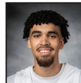
R.SO. // GUARD #2

Mins/Game: 15.5 Points/Game: 5.1 Shooting %: 50.5 Shot Attempts: 46-91 3pt Shooting %: 45.2 3pt Shooting: 28-62 Free Throw %: 80.0 FT Attempts: 12-15 Reb./Game: 1.7