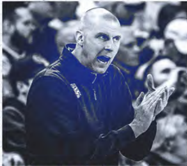
THE MARK POPE ERA