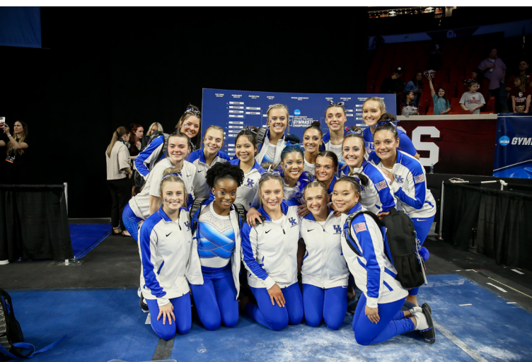
2023 - 6th Place