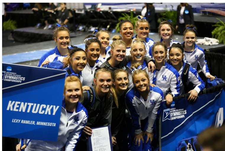
2018 - 12th Place