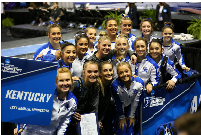
2018 - 12th Place