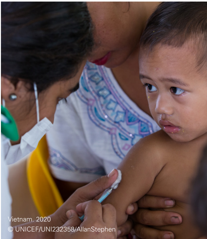
Vietnam. 2020