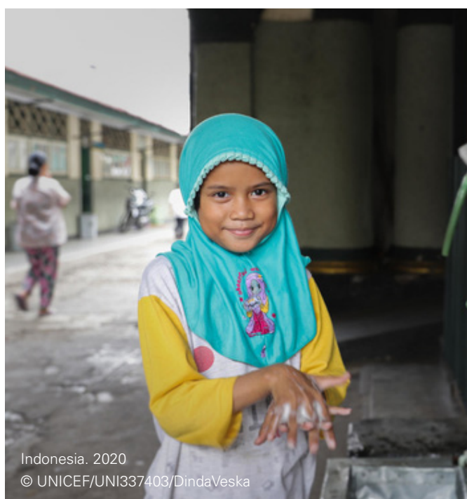
Indonesia. 2020

Access to clean water, sanitation and hygiene has been at the centre of UNICEF's response to COVID-19. Proper handwashing with soap and water has probably been the most visible and widely voiced message of the pandemic by UNICEF in partnership with governments, stakeholders and private sector partners and rightly so, since it is a key prevention measure against COVID-19. People are following the advice, according to many real time surveys, such as on Yougov.com. But more needs to be done. Maintaining the gains made during the pandemic and ensuring that hand hygiene habits take root permanently will require ongoing intensive efforts by all concerned stakeholders.