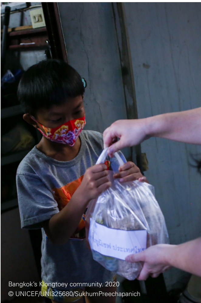
Bangkok's Klongtoey community. 2020