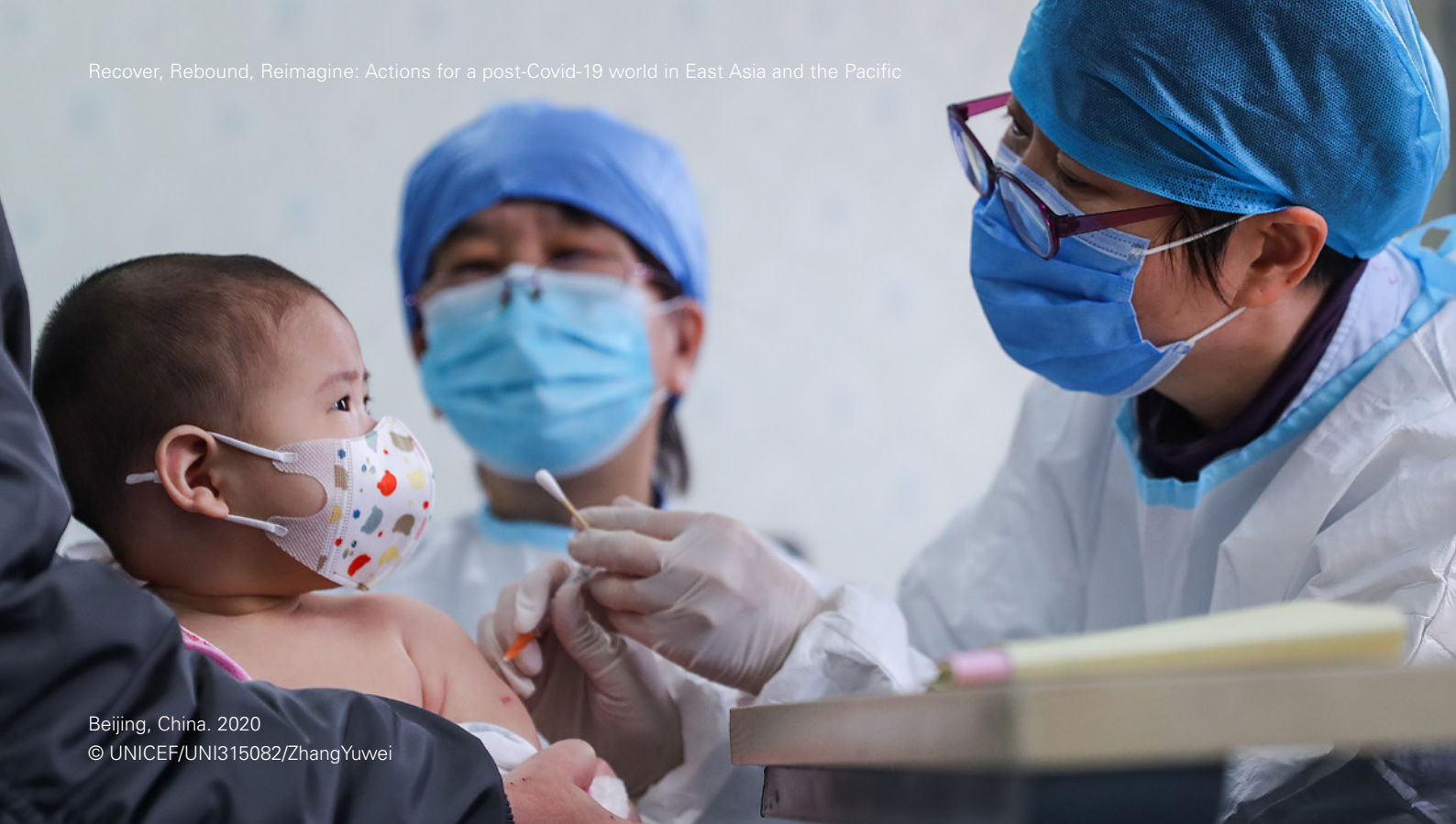
Beijing, China. 2020