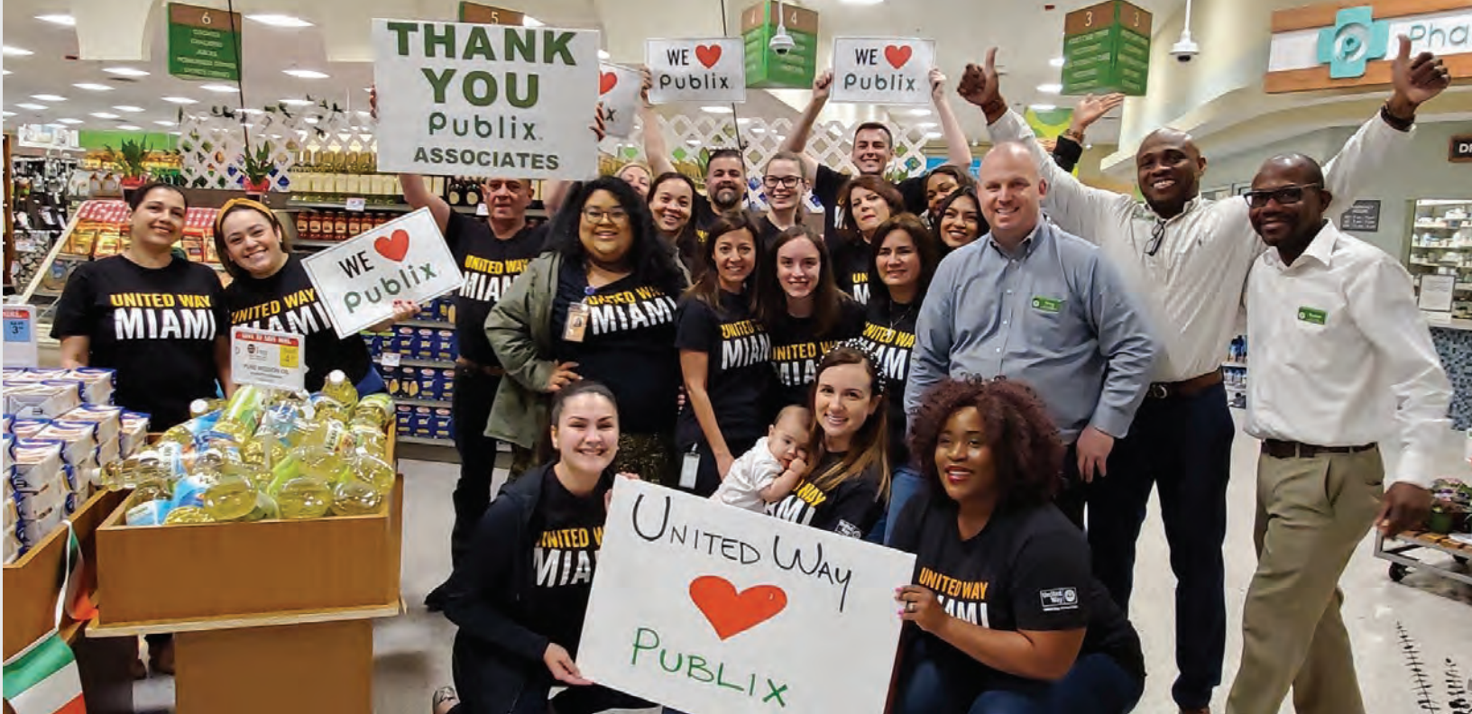
Publix Super Markets