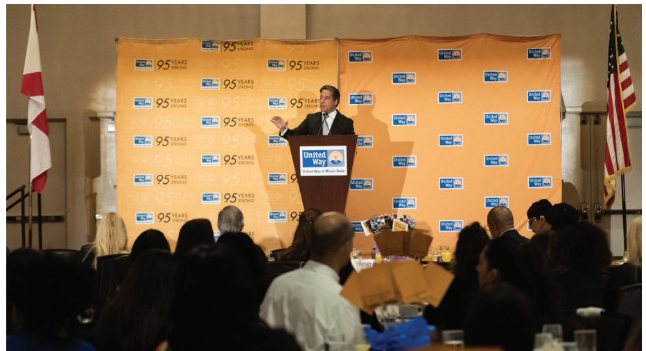
Miami-Dade County Public Schools