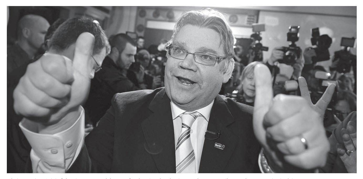
Chairman Timo Soini of the Finns Party celebrates after hearing the election results on 17 April 2011.

The landslide victory of the (True) Finns Party in the Finnish parliamentary elections in April 2011 was expected to affect the country's policy towards the European Union (EU). A party which openly labelled itself as populist and was known for its anti-immigration and Eurosceptic tone had won 19.1% of the vote.