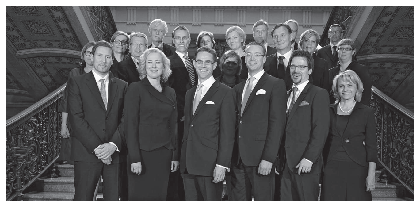
The Katainen Government on the stairs of the House of the Estates on 22 June 2011.

in the election funding scandals of the 2007 elections. In addition, it had to defend the unpopular programmes for Greece, Ireland and Portugal in the run-up to the elections.