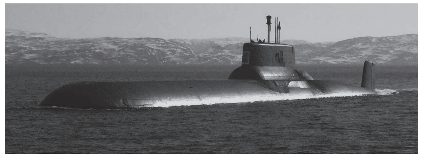
Russian Typhoon SSBN