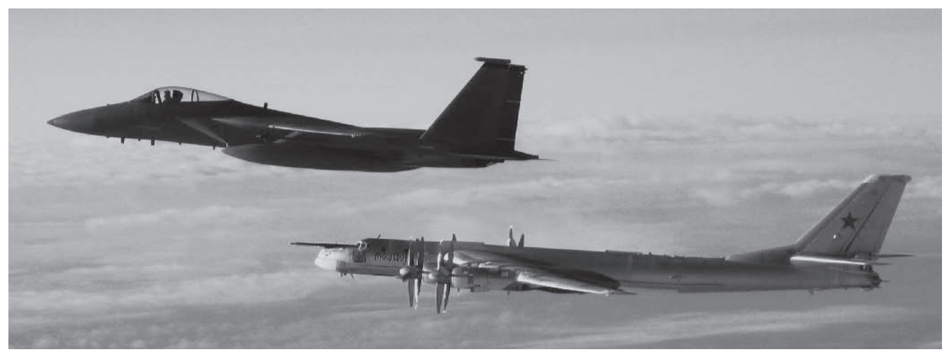
Russian Tu-95 Bear Bomber intercepted by American F-15C