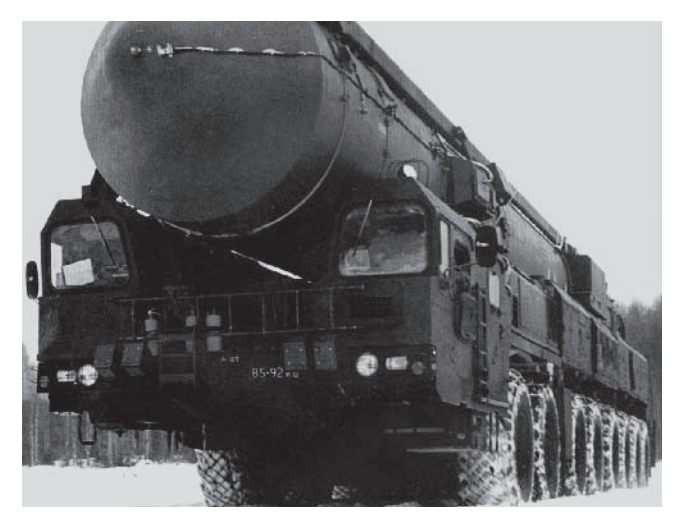
RT-2UTTH Topol M