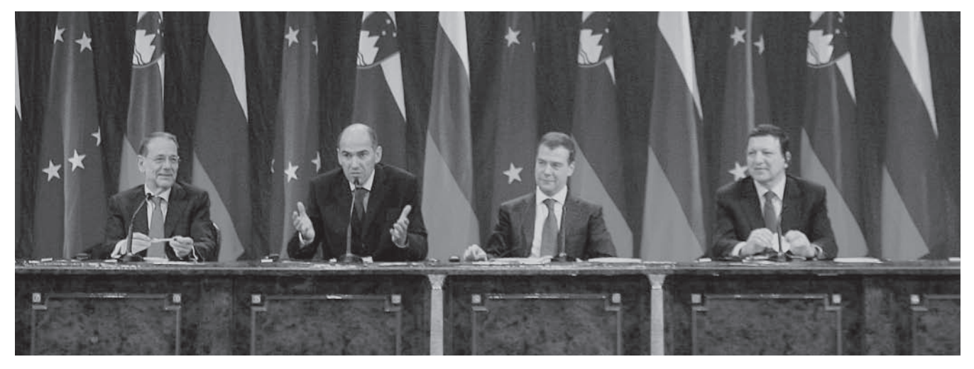
Press conference after the 21st EU-Russia Summit