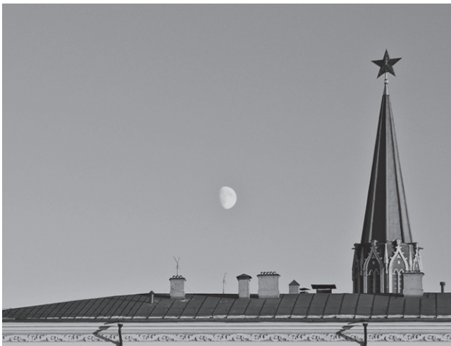
Kremlin under the moon