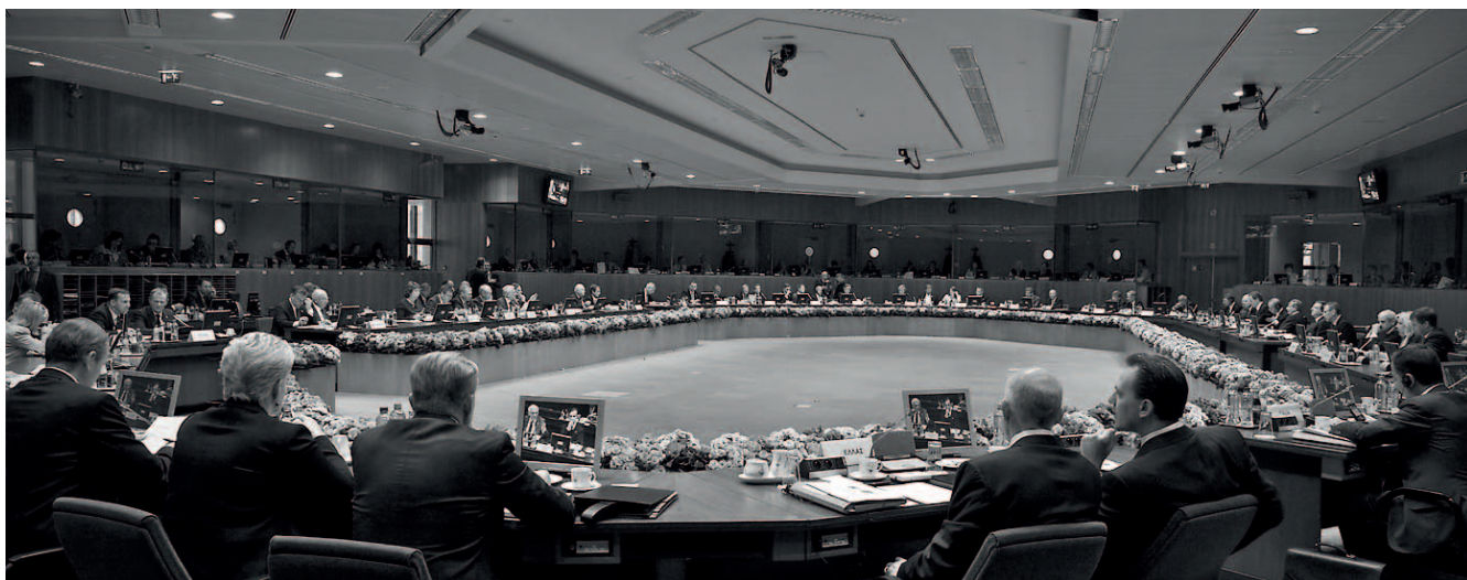
A meeting of the European Council.

At first glance the EU's political system doesn't seem to correspond to any contemporary type of regime. There is a directly elected European Parliament (EP), but the way of constructing relations of power and accountability between the parliament and the three bodies with executive powers, the Commission, the European Council or the Council, complicates the picture. The Commission's accountability to the European Parliament has been confirmed in the founding treaties ever since their conclusion. But what is the value of such a rule when there seems to be a much more powerful executive emerging beyond the reach of any EU-level accountability, namely the European Council?