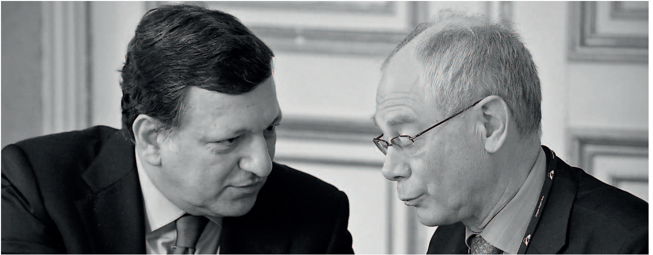
José Manuel Barroso, the President of the Commission and Herman van Rompuy, the President of the European Council.

The contours of semi-presidentialism have become accentuated both through the deepening and extension of parliamentary rule and through the simultaneous reinforcement of the EC. The two parts of the executive come together in the EC, of which the President of the Commission is a member. The EC's presidentialist characteristics are furthermore stressed through its role in the appointment of the latter. In spite of the fact that the EC can neither dismiss the Commission nor its president, its proposal is still key in the appointment procedure. 4