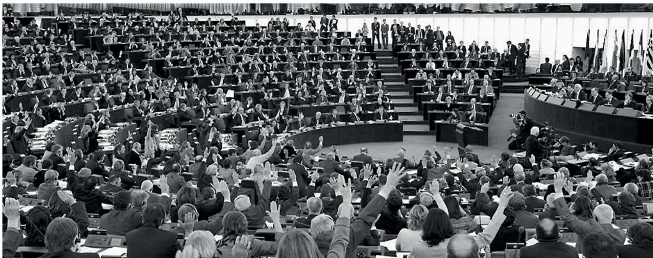
The European Parliament approved the new European Commission by 488 votes to 137 in February 2010.

The parliamentary part of the EU's regime fulfils the normal criteria of parliamentarism with, however, a couple of significant exceptions. The principle of parliamentarism was already confirmed in the initial treaties, which entitled the EP to dismiss the Commission in a vote of censure. The validity of the principle has not been seriously questioned, but its applicability has been seen to be challenged by the demand according to which it can only be applied to the entire Commission and not to individual members of it. In the recent treaty changes, an indirect possibility has been created for the EP to, if necessary, push individual commissioners to resign. This is made possible through a provision originally included in the Nice Treaty (TEC, art. 217), according to which the President of the Commission can ask an individual member of the Commission to resign. The possibilities included in this provision were finally made visible in the inter-institutional agreement between the Barroso II Commission and the EP (Framework agreement on relations between the European Parliament and the Commission. 9.2.2010). It was confirmed that should the EP demand it, the President of the Commission will ask an individual commissioner to resign.