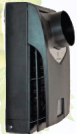
Back View With Optional Duct Adapter