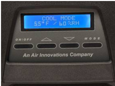
Front Digital Display