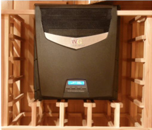
Front View in Racking