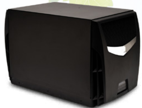
TTW unit out of racking